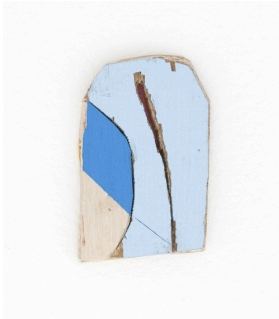
Lisi Raskin, Untitled (for DN 5) , 2014 acrylic paint on wood 1 3/4 x 1 1/8 inches

Raskin's work values people at the heart and people first. It is important to note that materials used in her work capture the energy of all those involved. We are reminded that a work of art is never just one thing, there are thousands of forces that go into making it, and with, especially within a gallery or institution, the many people that are involved that make up that space, their families and loved ones and all those seen and unseen forces that influence thoughts and actions.