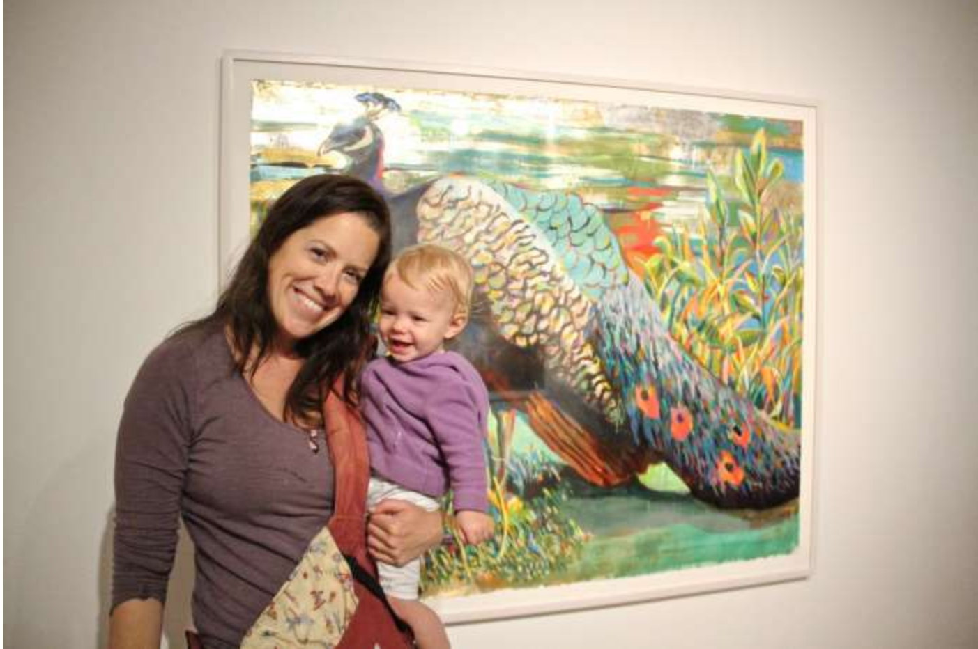
Start them young to have fun at art openings