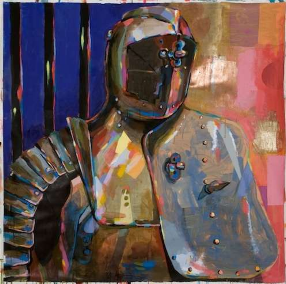
Battle Armor by Karen Heagle

By admin On 05/13/2013 · Leave a Comment