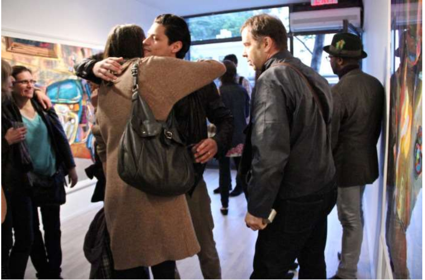
Friends who love art get a hug