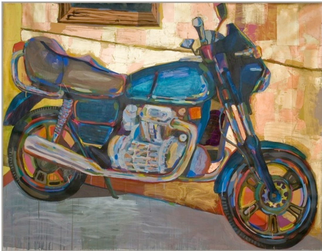
Karen Heagle , Prodigal Daughter , 2013, acrylic, ink, and collage on paper, 62 3/4 x 79 inches; Courtesy of the artist and Churner and Churner.

I've started using collage, gold leaf, and copper leaf, preferring to work on a larger scale. I engage my mediums with a blunt yet expressive physicality." Heagle treats paper as if it were canvas; her figures and objects rendered life-sized and the application of the various leafing sheets give the work an otherworldly light, such that they call to mind Russian icons or the Northern European devotional triptychs of van Eyck.